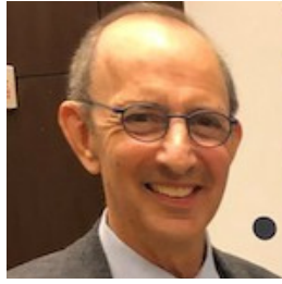
Geoffrey Grief Family Therapy